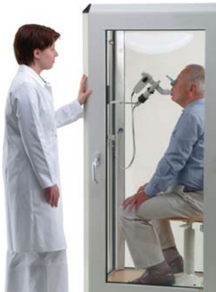
Lung function testing

Medical knowledge and opinion varies according to the extent and availability of research and differing assessments of such research by different practitioners. Whilst the information contained in this leaflet has been compiled by the Fungal Research Trust from sources believed to be reliable, the Trust cannot guarantee the accuracy or completeness of such information and cannot accept any responsibility for any use of such information.